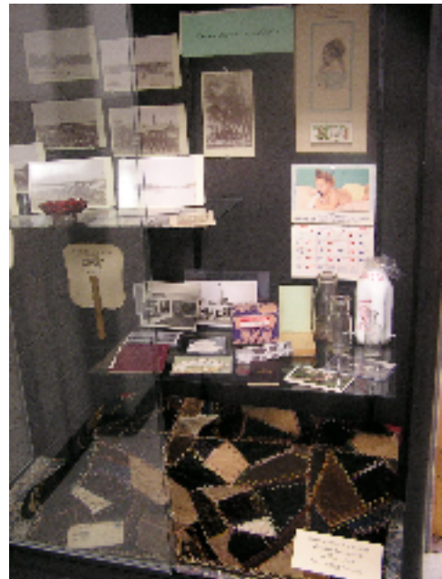
New collection objects at the courthouse office