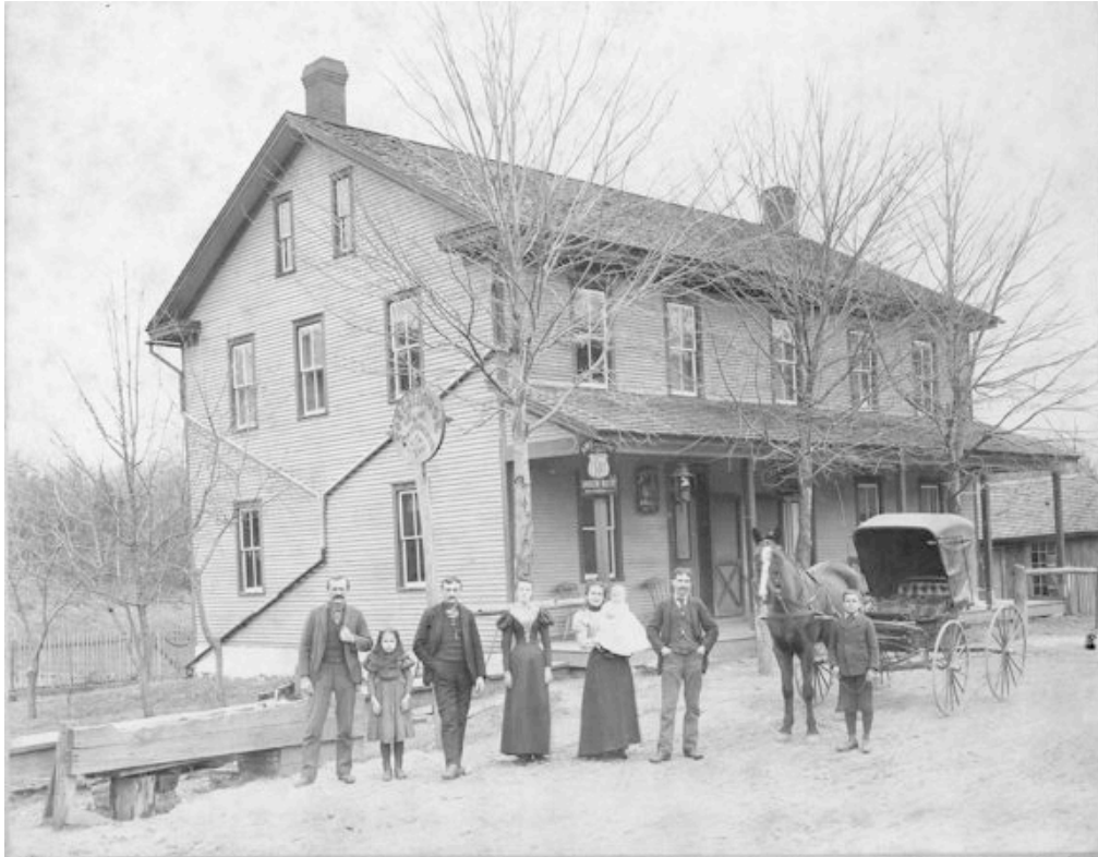
Forest House, one of the oldest continuously operating businesses in Union County, is located west of Forest Hill. A cabinet photograph features its inn-keeping family from c. 1890-1910.

House/Lewisburg Hotel (since 1832), the Mifflinburg Hotel (since 1858), and Forest House (since 1866). Another early hostelry, The Shearer Inn (later called The American Hotel), occupied part of what is now the Packwood House Museum located at Market and North Water Street in Lewisburg.