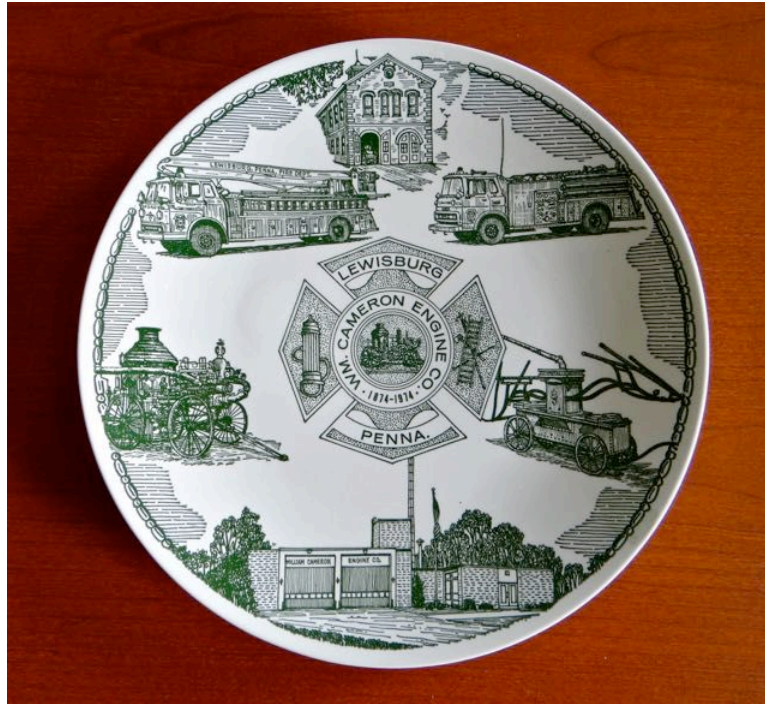
Centennial plate issued in 1974. From the collection of the Union County Historical Society.

companies formed in Lewisburg in 1872, in Mifflinburg in 1898, and in New Berlin in 1932.